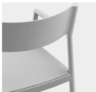
Aluminium (only available for Chair & Stackable armchair)