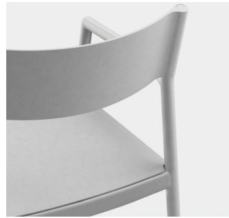
Aluminium (only available for Chair & Stackable armchair)