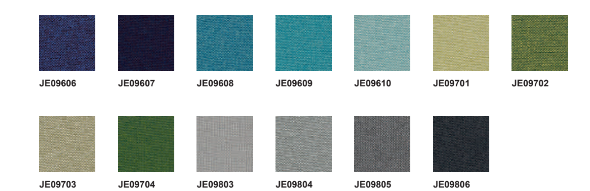
(*) Not available for Cila and Cila Go collections

Arper grade CHAIRS: A SOFAS: A PANELS: A